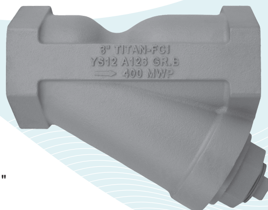
3" YS 12-CI