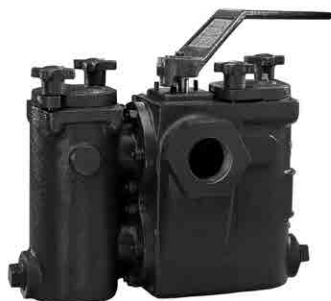
Models 792SH, 794SH

Bolted Covers required above 150 psi or 200°F.