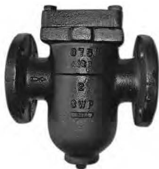
Models 165-B, 166-B

165-B Al-Brz Class 150 166-B Al-Brz Class 300