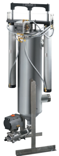
DCF-800 twin actuator model

DCF-1600 - Two actuators isolate the actuation mechanism from the filtrate with a bridged system. The benefit is a long operating life in challenging conditions.