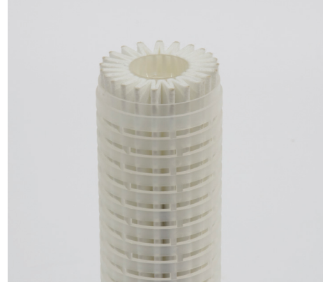
Rigid High Capacity Pleats

This chart represents typical water flow per 10" cartridge length. The test fluid is water at ambient temperature. Extrapolation for multiple elements tends to be linear, but as flows increase the \Delta of the housing becomes more apparent