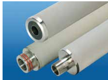
LOFMET filter cartridges are available with a variety of gasket and end cap configurations.

The micron ratings shown at various efficiency and beta ratio value levels were determined through laboratory testing, and can be used as a guide for selecting cartridges and estimating their performance. Under actual field conditions, results may vary somewhat from the values shown due to the variability of filtration parameters. Testing was conducted using the single-pass test method, water at 3 gpm/10" cartridge (9.45 l/min). Contaminants included latex beads, coarse and fine test dust. Removal efficiencies were determined using dual laser source particle counters.